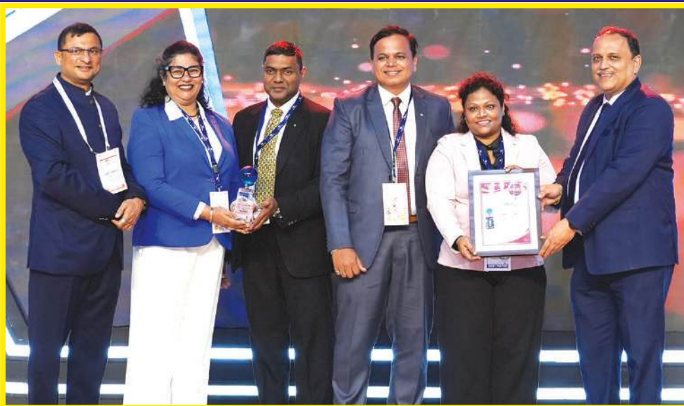
HØEGH AUTOLINERS INDIA PVT. LTD.