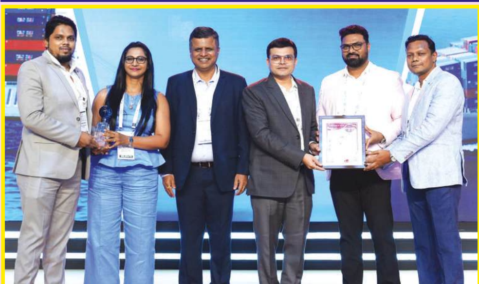
ON BASIS OF VOLUME - WAN HAI LINES LTD.