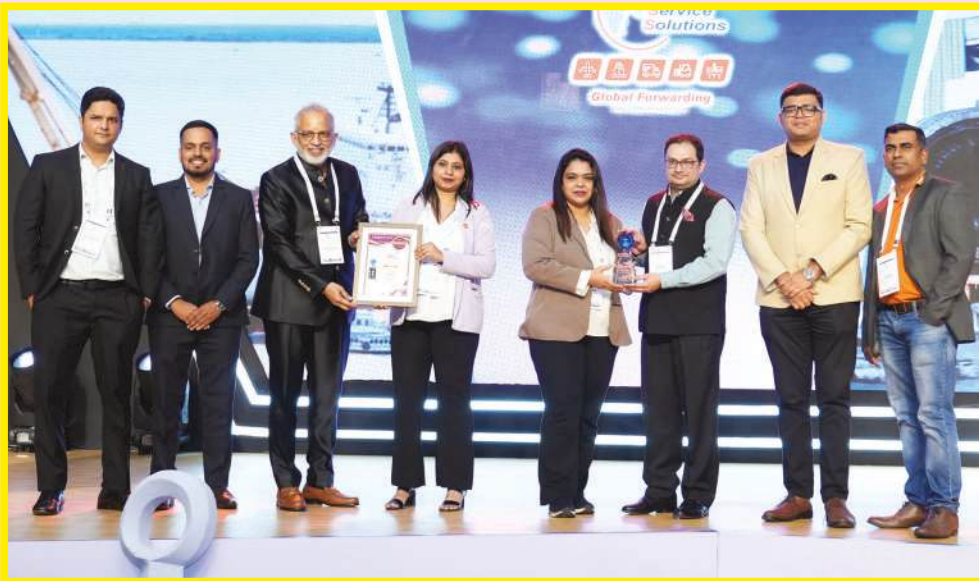
ISSGF INDIA PVT. LTD.