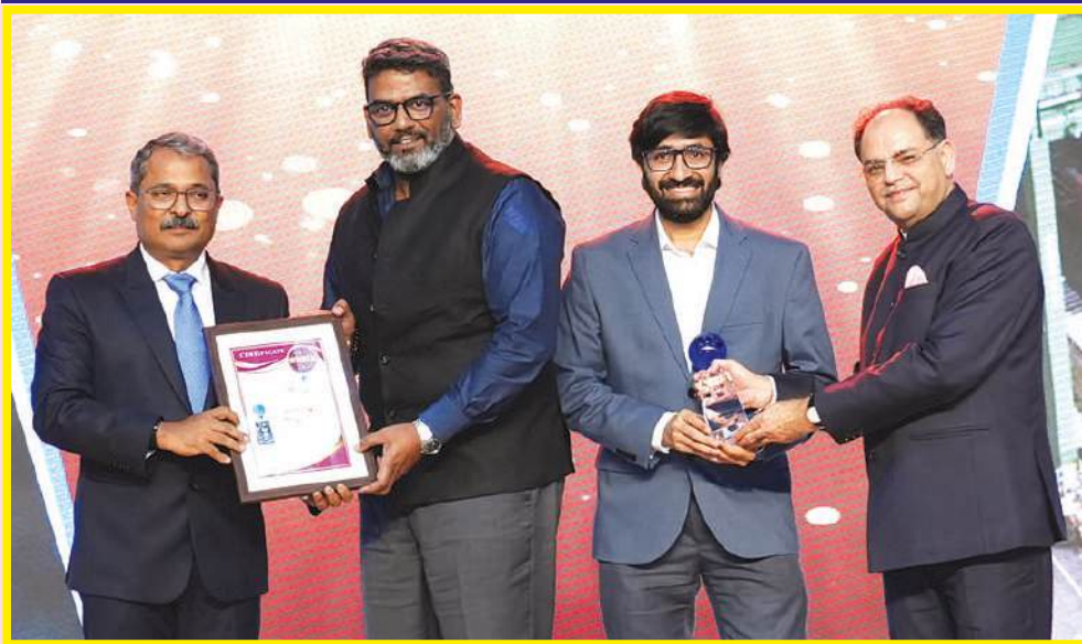
ON BASIS OF VOLUME - PSA MUMBAI