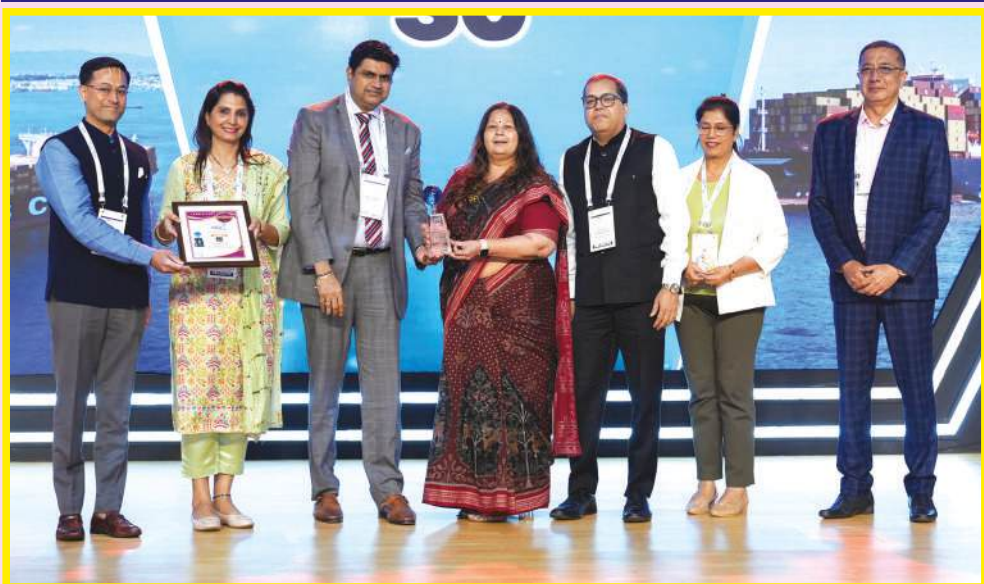
ON BASIS OF VOLUME - MEDITERRANEAN SHIPPING COMPANY