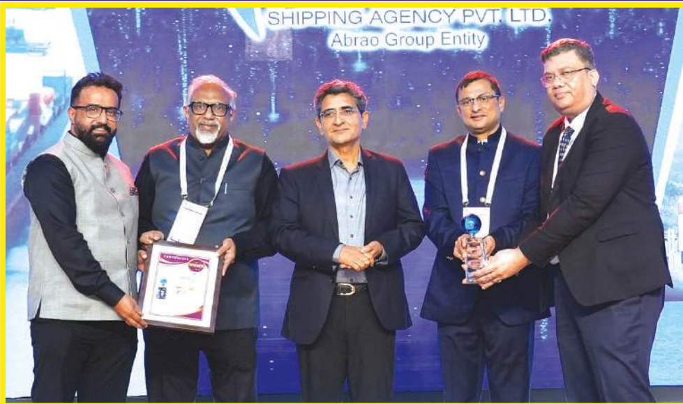
ON BASIS OF VOLUME - POSEIDON SHIPPING AGENCY PVT. LTD.