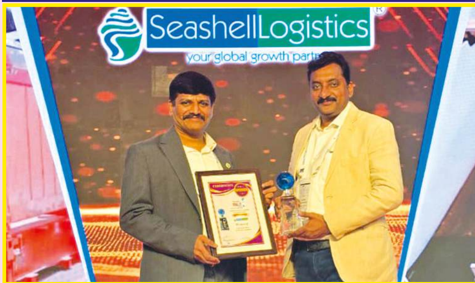
SEASHELL LOGISTICS PVT. LTD.