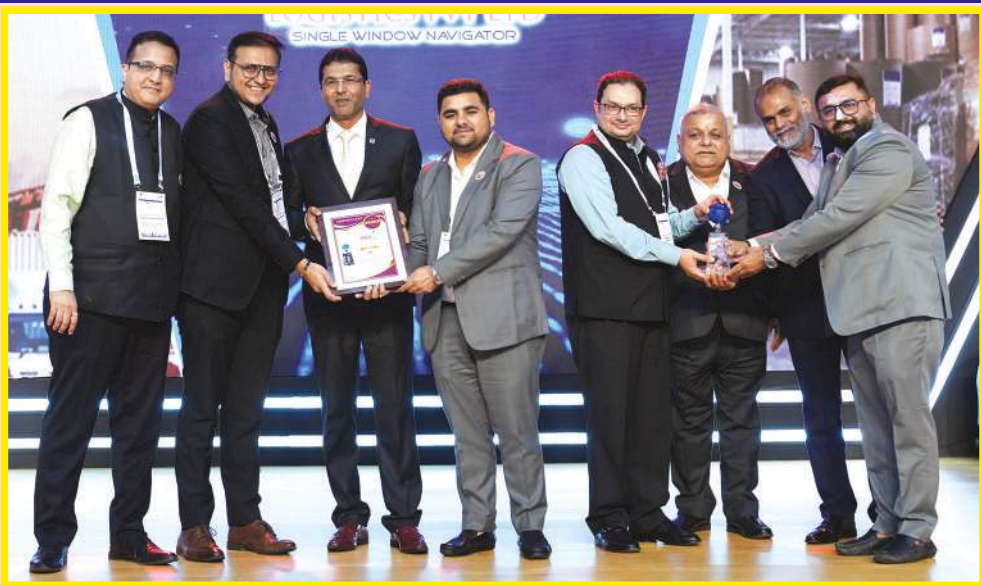
KALASH GLOBAL LOGISTICS PVT. LTD.