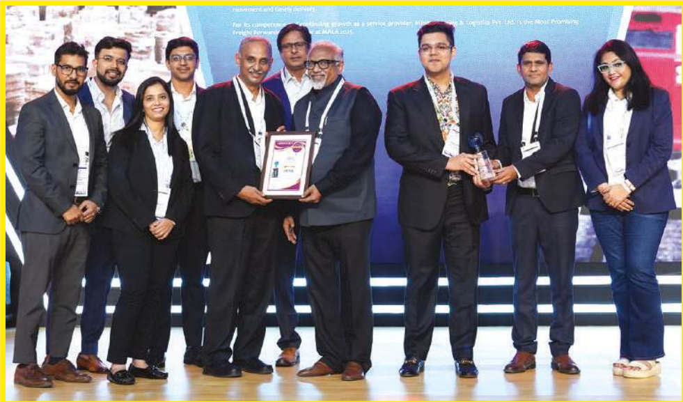
MPRS SHIPPING & LOGISTICS PVT. LTD.