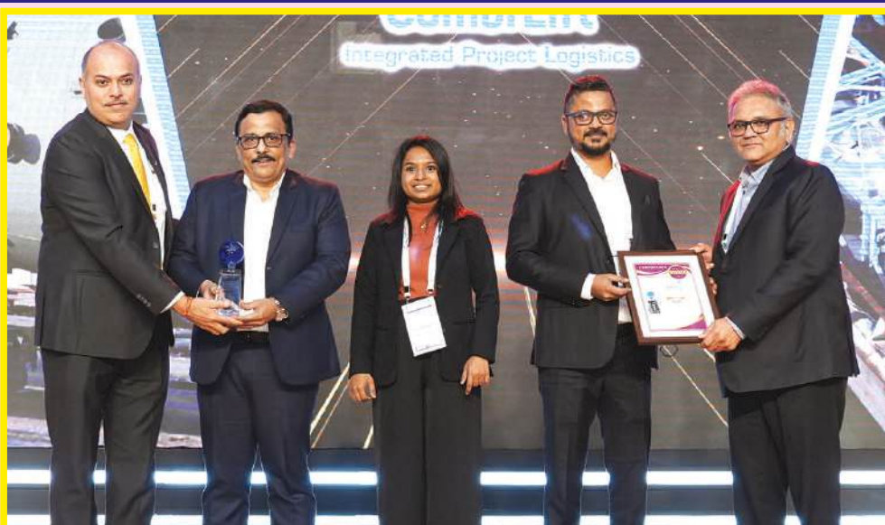
ON BASIS OF GROWTH - COMBI LIFT PROJECT LOGISTICS INDIA PVT LTD