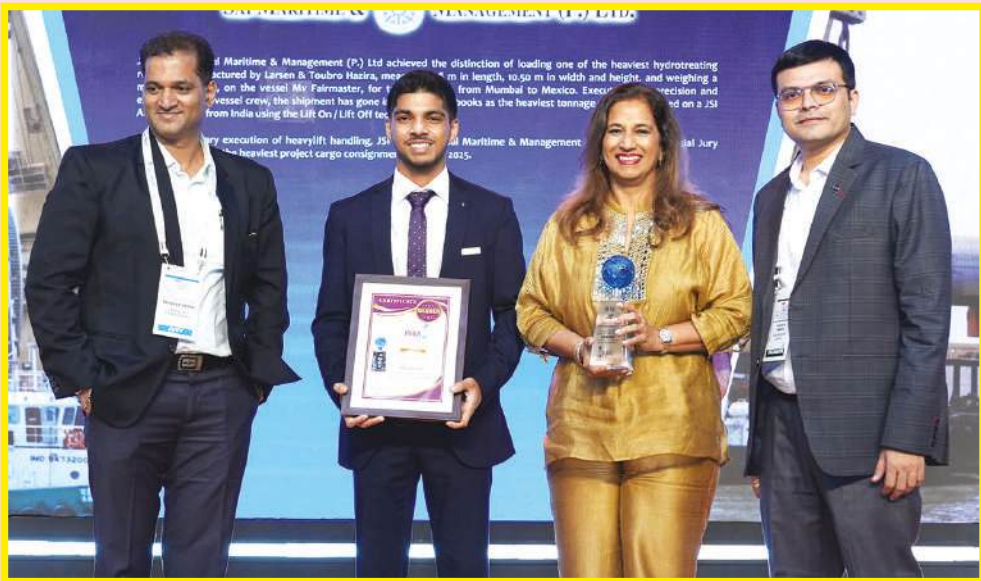
JSI ALLIANCE & SAI MARITIME & MANAGEMENT (P.) LTD.