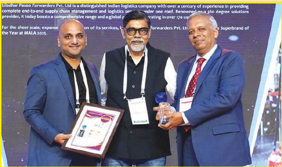
LILADHAR PASOO FORWARDERS PVT. LTD.