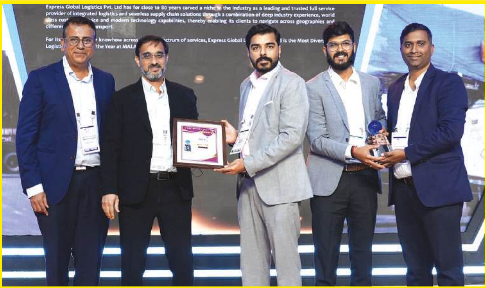
EXPRESS GLOBAL LOGISTICS PVT. LTD.