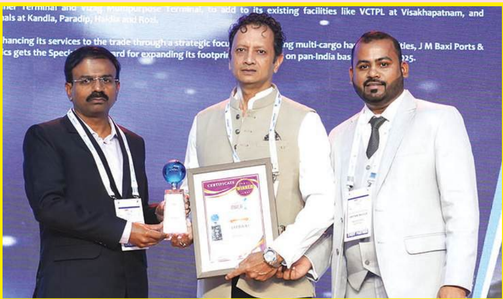
J M BAXI PORTS & LOGISTICS