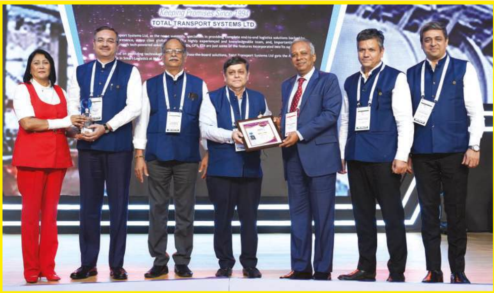
TOTAL TRANSPORT SYSTEMS LTD.