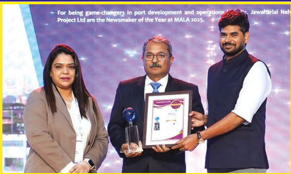
JAWAHARLAL NEHRU PORT AUTHORITY & VADHVAN PORT PROJECT LTD (FOR BEING GAME-CHANGERS IN PORT DEVELOPMENT)