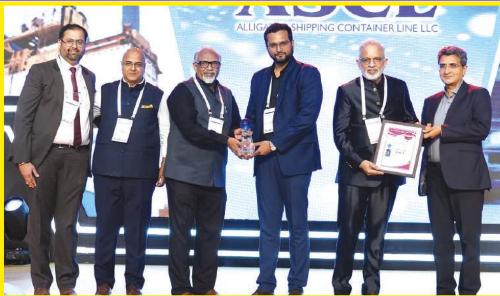
ON BASIS OF GROWTH - ALLIGATOR SHIPPING CONTAINER LINE (ASCL)