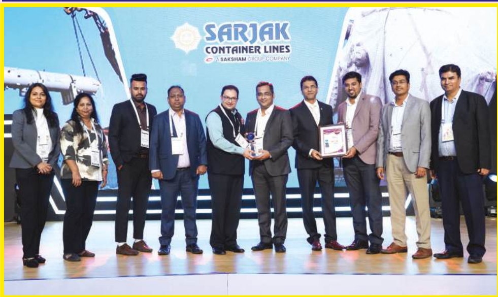
SARJAK CONTAINER LINES PVT. LTD.