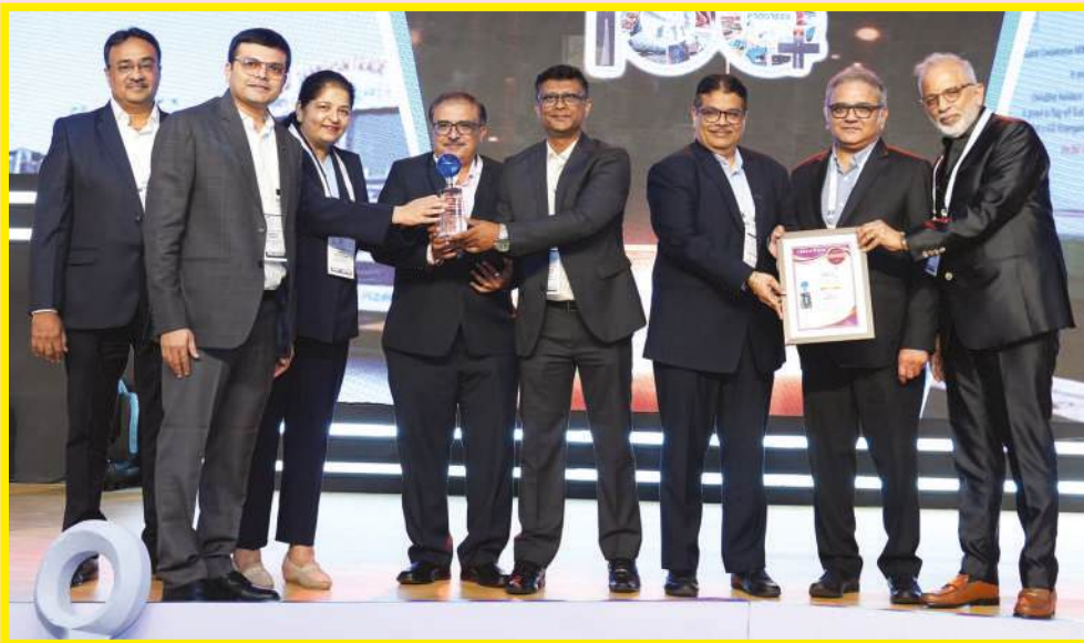
CKB GLOBAL LOGISTICS PVT. LTD.