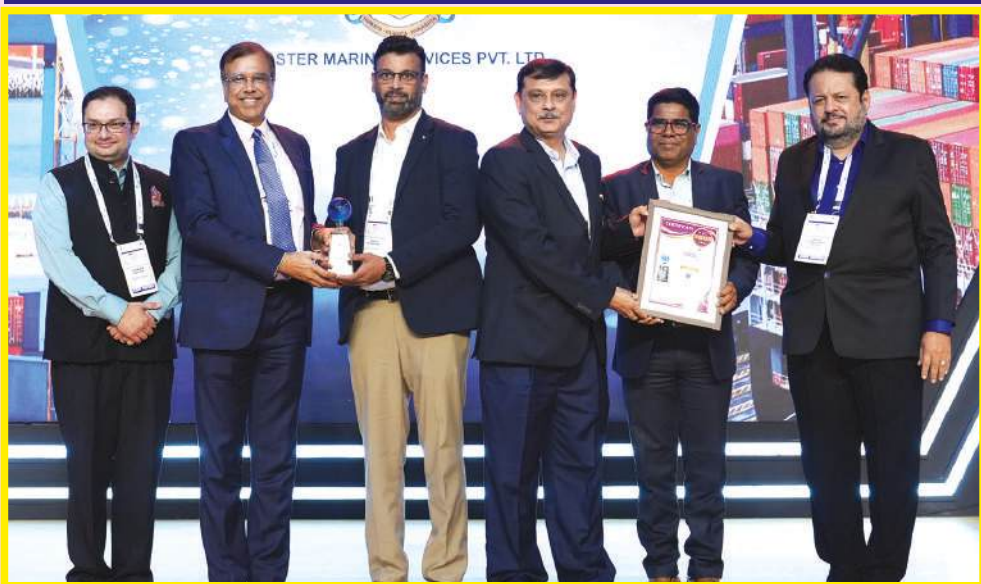
MASTER MARINE SERVICES PVT. LTD.