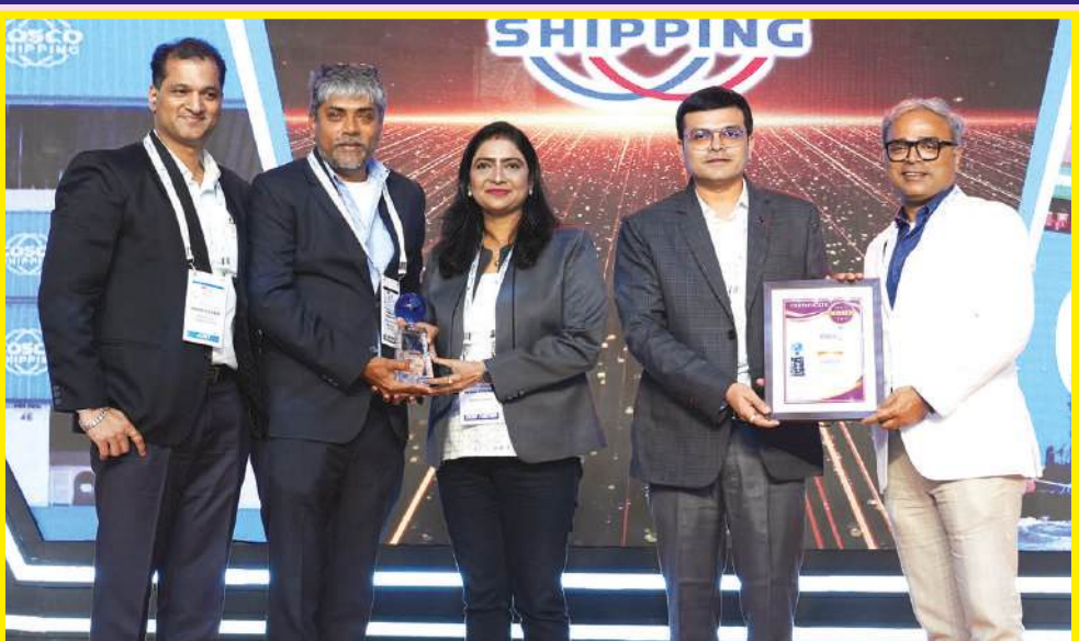
ON BASIS OF GROWTH - COSCO SHIPPING LINES