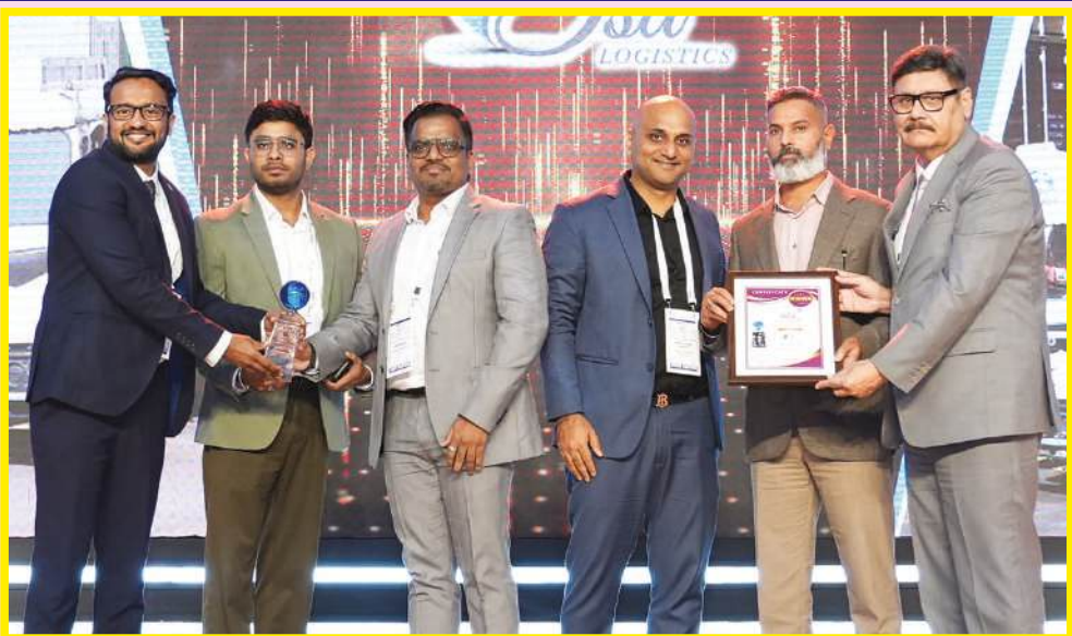
ISA LOGISTICS PVT. LTD.