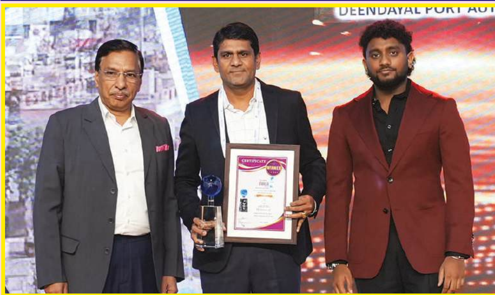
ON BASIS OF GROWTH - DEENDAYAL PORT AUTHORITY