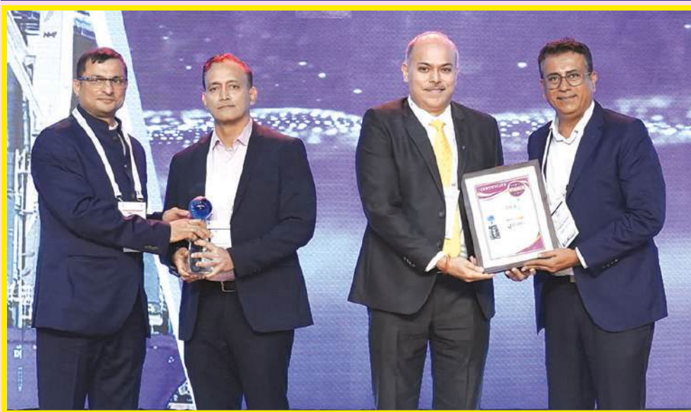
IN BREAK BULK OPERATOR SEGMENT - BAHRI LINE