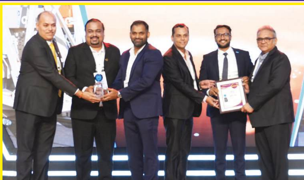
ON BASIS OF VOLUME - DEUGRO PROJECTS (INDIA) PVT. LTD.