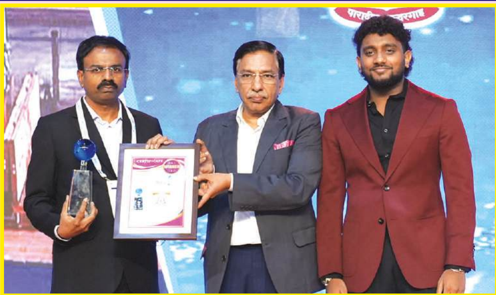
ON BASIS OF VOLUME - PARADIP PORT AUTHORITY