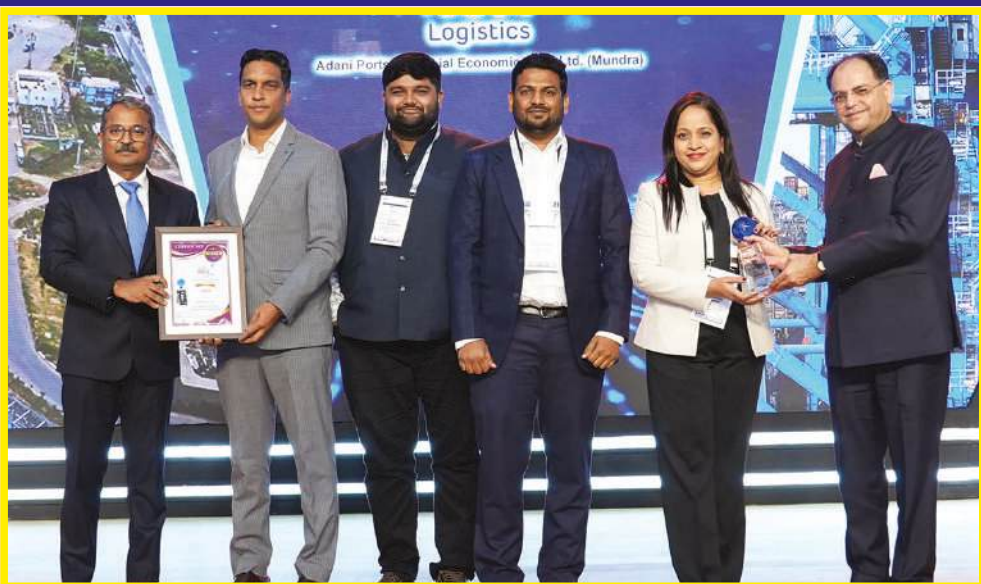
ADANI PORTS AND SPECIAL ECONOMIC ZONE LIMITED (MUNDRA)