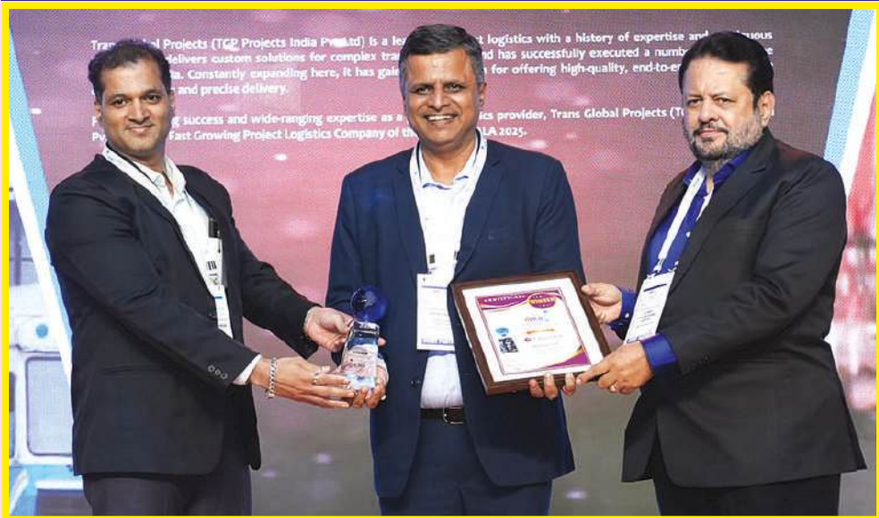
TRANS GLOBAL PROJECTS (TGP PROJECTS INDIA PVT LTD)