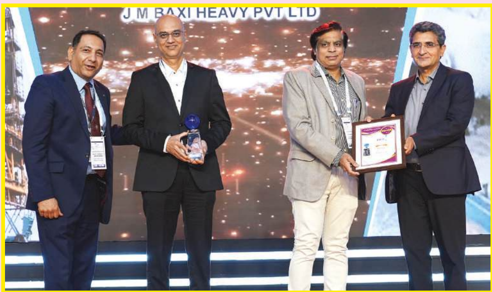
J M BAXI HEAVY PVT LTD