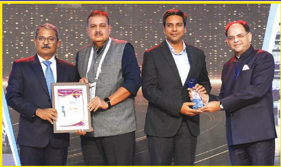
ON BASIS OF GROWTH - APM TERMINALS MUMBAI