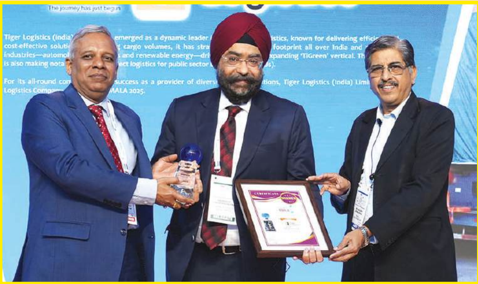
TIGER LOGISTICS (INDIA) LIMITED