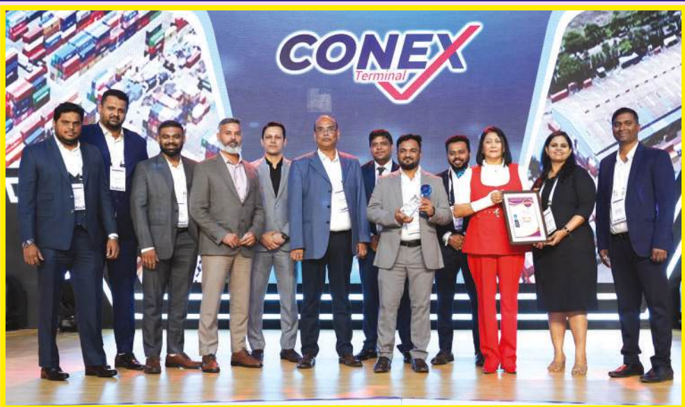
IN SPECIFIC - CONEX TERMINAL PVT LTD