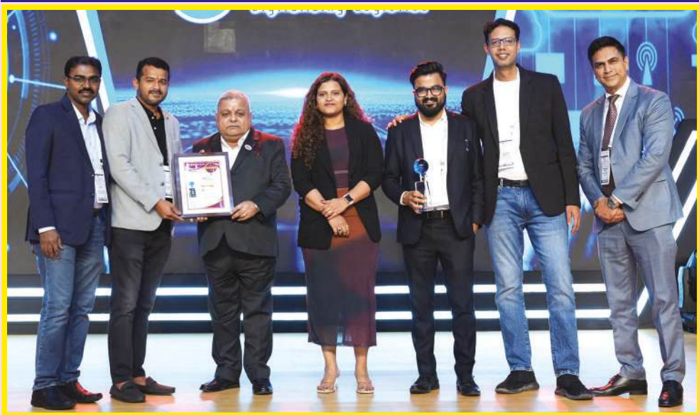
SOFTLINK GLOBAL PRIVATE LIMITED