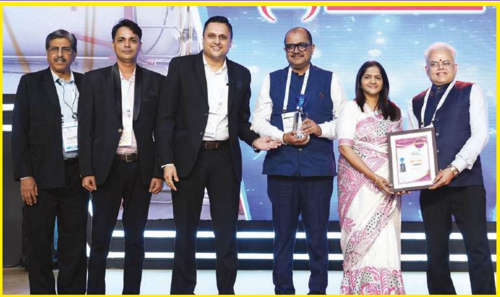
GOODRICH MARITIME PRIVATE LIMITED