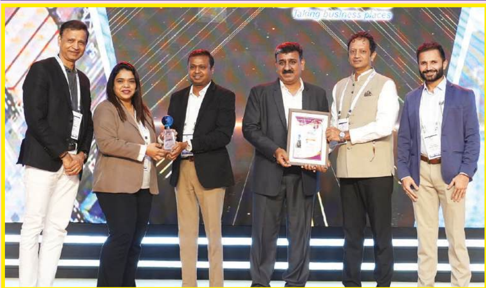
TEAMGLOBAL LOGISTICS PVT. LTD