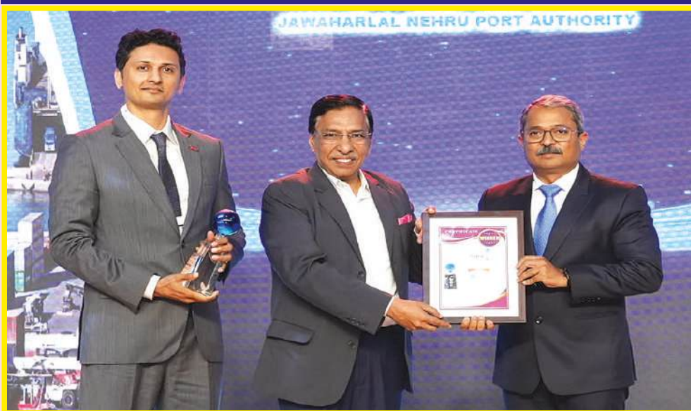
JAWAHARLAL NEHRU PORT AUTHORITY