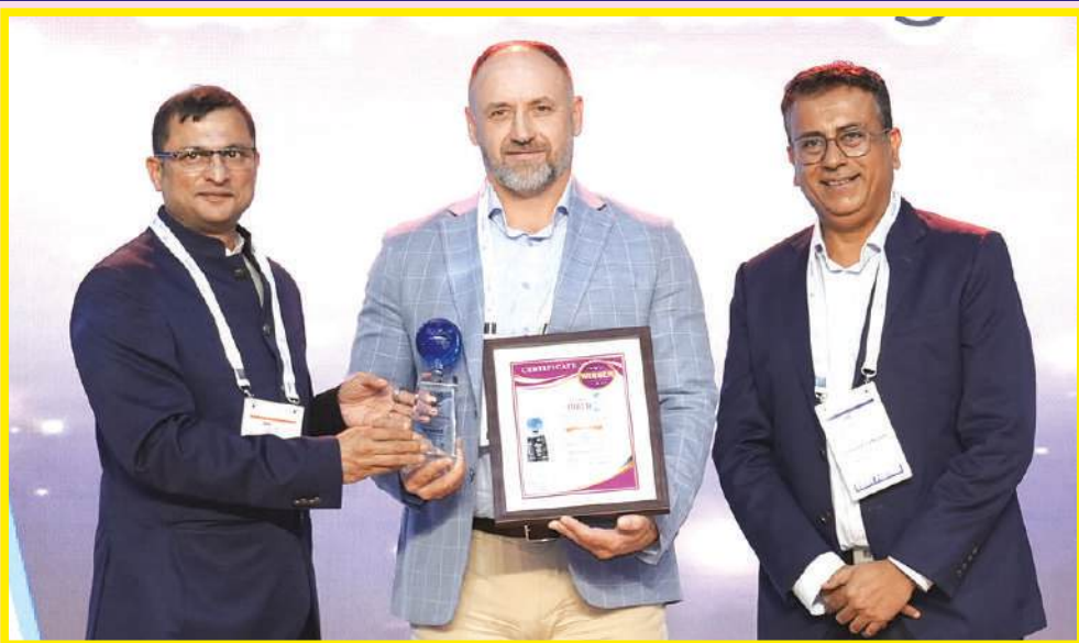
IN HEAVY LIFT / PROJECT OPERATOR SEGMENT - BBC CHARTERING CARRIERS GMBH & CO.