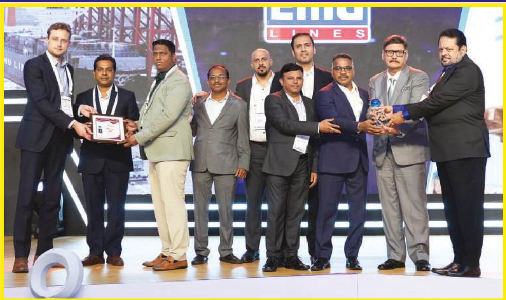
EMU LINES PVT. LTD.