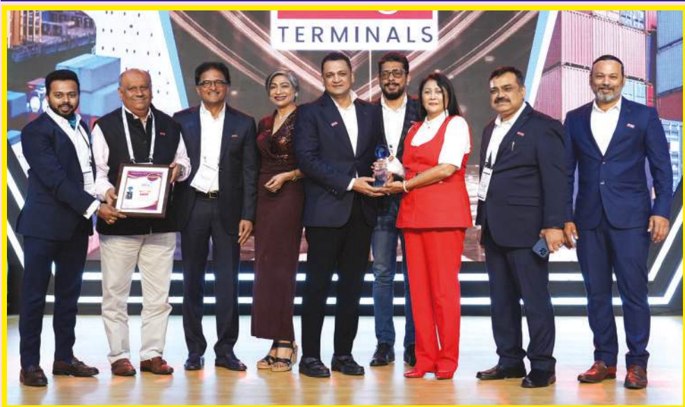
IN PAN INDIA - ALLCARGO TERMINALS LIMITED