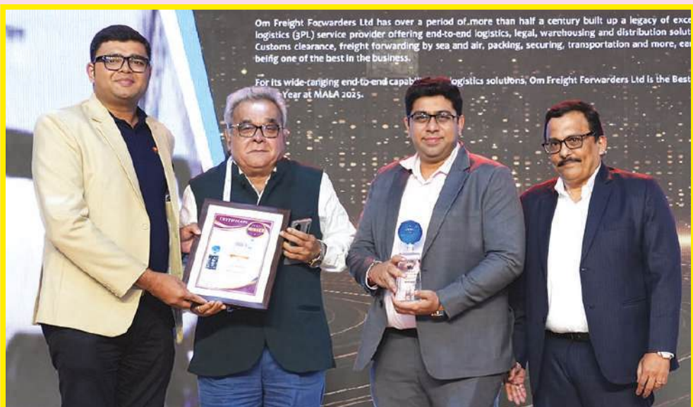
OM FREIGHT FORWARDERS LIMITED