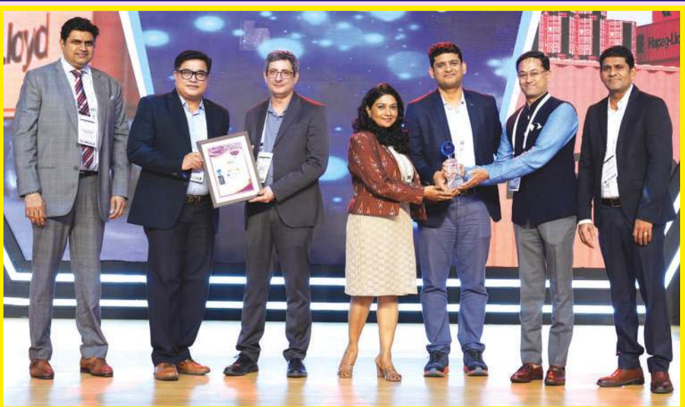
ON BASIS OF GROWTH - HAPAG-LLOYD